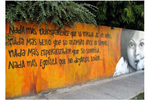
“ Paying a child for sex is a crime”